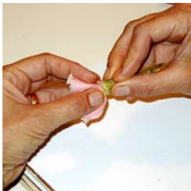
2. Pinch the flower