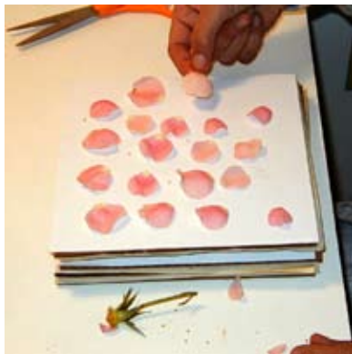
3. Lay out the flowers