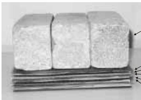
4. Put under heavy weight