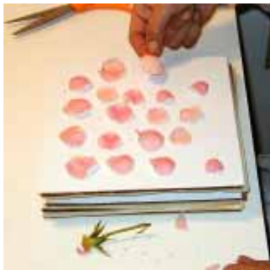
3. Lay out the flowers