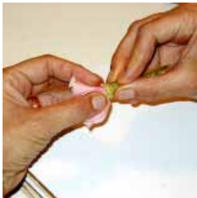
2. Pinch the flower